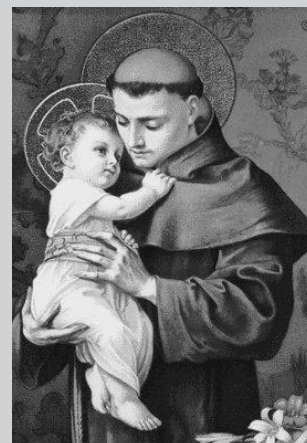
St. Anthony of Padua

Masses: Saturday 5:00 p.m. Sunday 8:30 a.m.